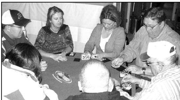
Free Texas Hold'em Every Wednesday at 7pm

Request a menu of our picnic food at 320-564-4003 or visit our website at www.bootleggerssupperclub.com The Ants won't know what they've run into!